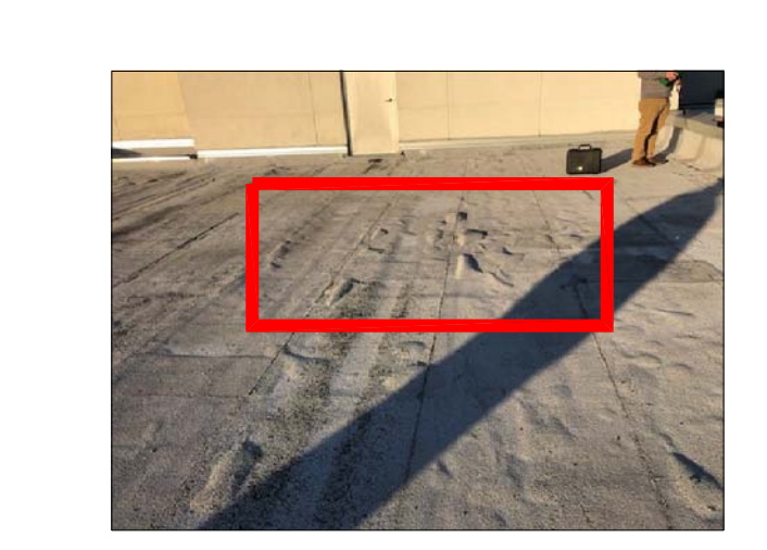
TYPICAL BLISTER PHOTOS

In some instances a single isolated blister will be repaired (left photo). In other areas where there are multiple closely spaced blisters then square off area to remove several blisters at once to be covered with a single patch. Work closely with Technical Inspector to prioritize blister repairs and to mark and measure repair areas.