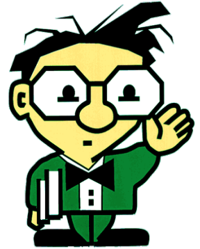
Safety Office Boy to the rescue!

If you have questions regarding respiratory fit testing, contact EH&S . If you have a question for the S.O.B., send an email to finlayba@evms.edu .